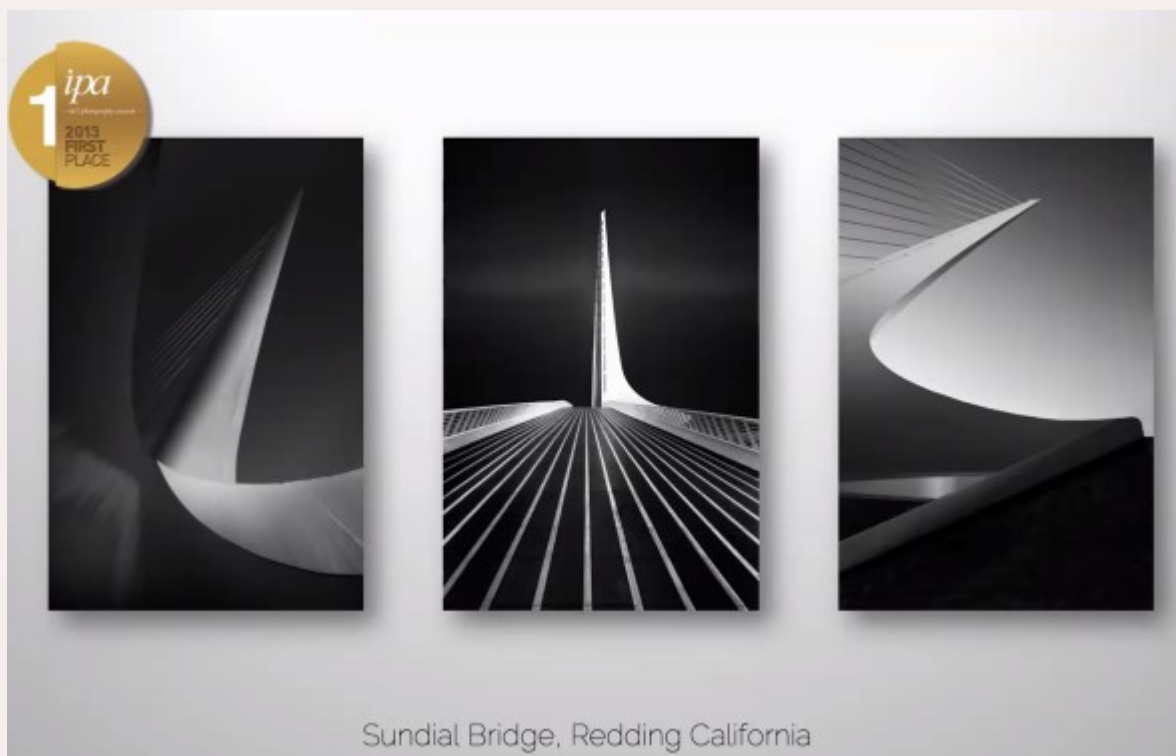
Sundial Bridge, Redding California