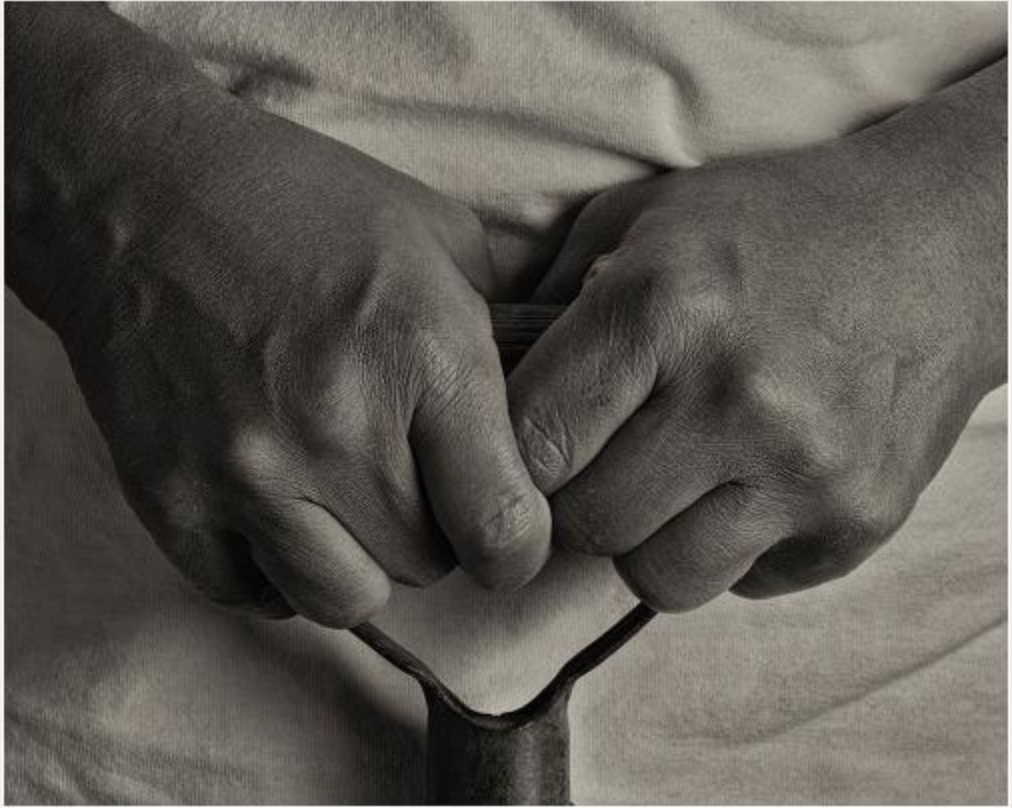
Gold - Superset "Parched Hands" by Ed Espin