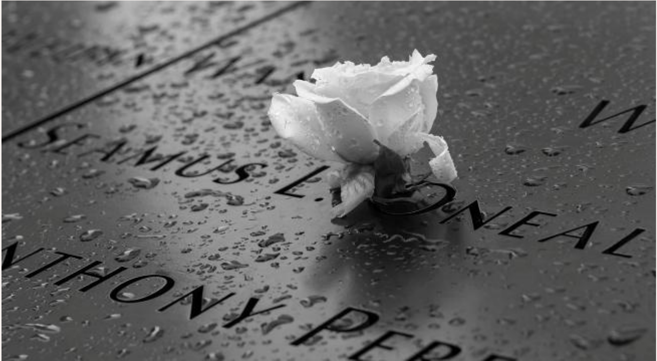
Gold & Gold of the Month - Intermediate "Nature Cries" by Penny Rintoul

All competition images may be viewed on our Website Photo Gallery or www.etobicokecameraclub.smugmug.com