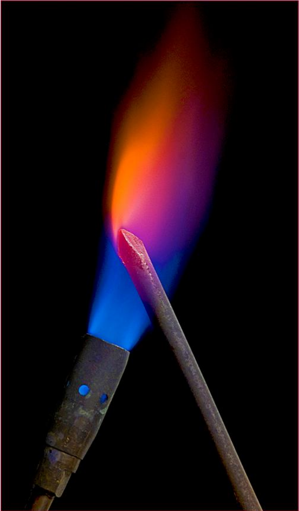
Silver "A Hot Tip" by Geoffrey Pierpoint