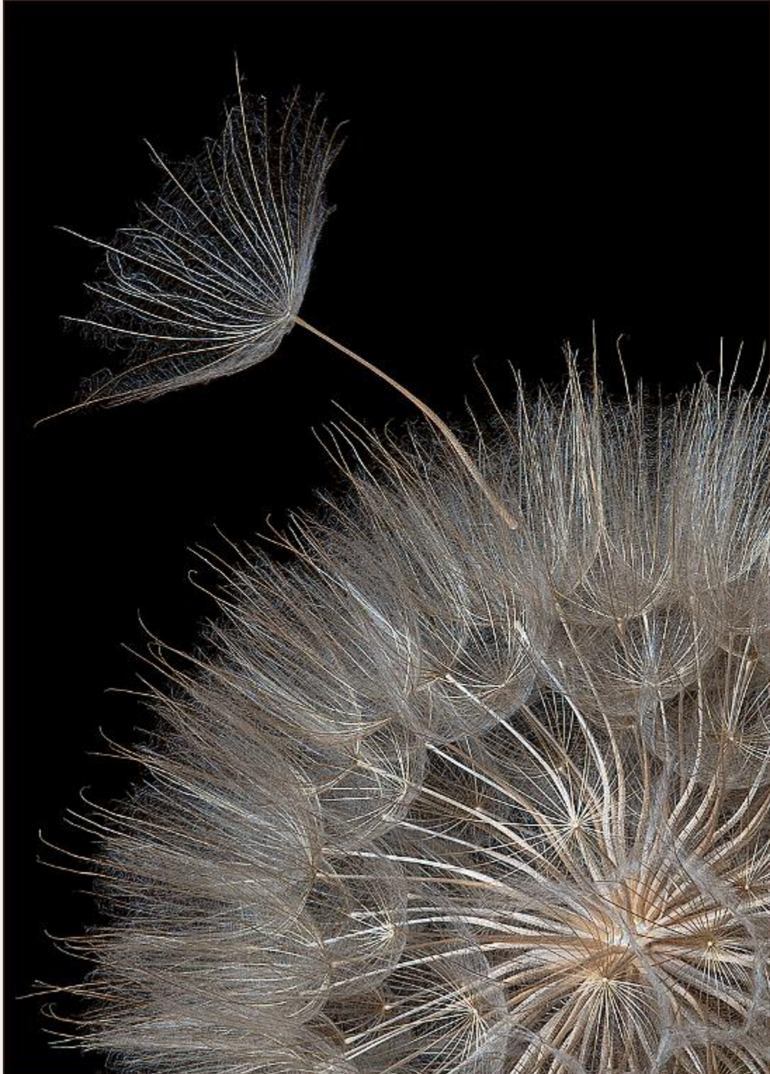
Gold "Dispersal" by Geoffrey Pierpoint

All competition images may be viewed on our Website Photo Gallery or www.etobicokecameraclub.smugmug.com