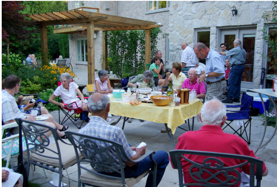
Summer BBQ – August 2007 (see the last page of Viewfinder for more pics)