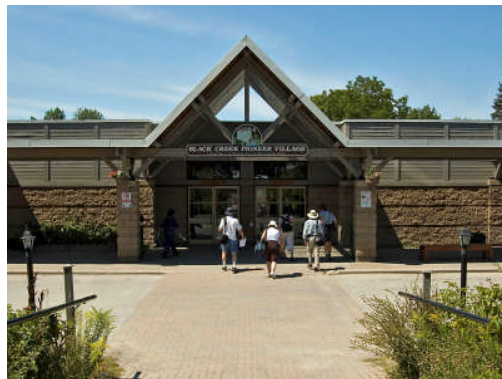
Pioneer Village Outing Prior to BBQ

finally, to Darcy’s standard poodle Soleil – the cleanup crew that didn’t always wait for the plates to be emptied before whisking the contents away!